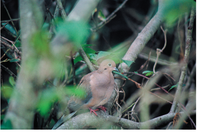
U. S. Fish and Wildlife Service

Mourning doves are monogamous and form strong pair bonds that persist during at least one nesting season. The breeding season is among the longest of all North American birds, with peak nesting activity occurring in late spring/early summer and a decline beginning in July. At the beginning of the breeding season, unpaired males devote considerable time to perch cooing and performing displays such as flapping/gliding flight to attract females. When performing the flapping/gliding flights, a male leaves his cooing perch with a vigorous and noisy flapping of his wings, rising up to 100 feet in the air. He then extends his wings and begins a long spiraling glide back down. The perch coo is one of the few vocalizations