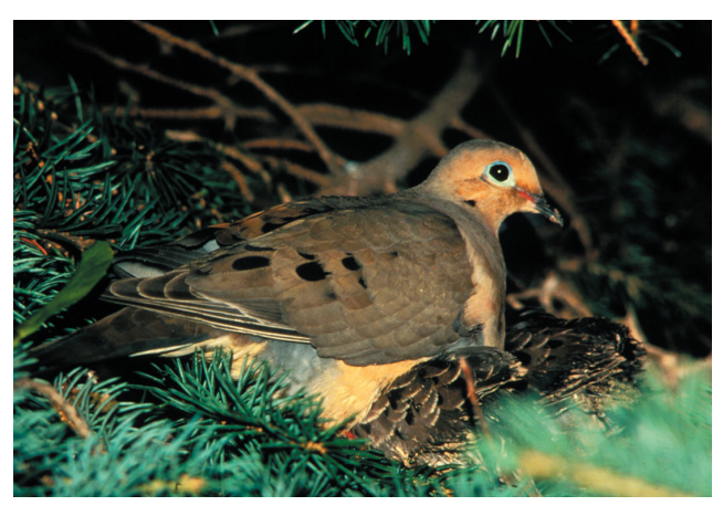
\hbox{ U. S. Fish and Wildlife Service} \\ Both \ parents \ care for \ the \ young \ by \ nour ishing \ them \ with \\ crop \ milk.

Table 3 provides a summary of mourning dove habitat requirements. For planning purposes, use table 4 to subjectively rate the availability and quantity of mourning dove habitat within a planning area, based