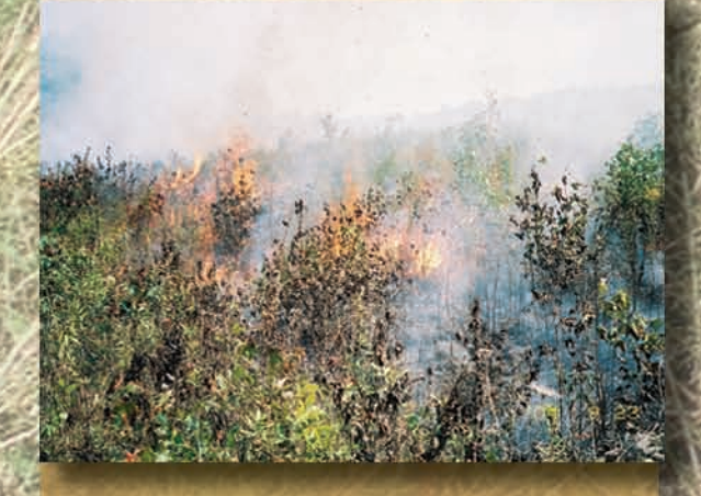
Figure 5. Burning in September is an effective technique for killing woody saplings and stimulating desirable legumes in the seedbank.