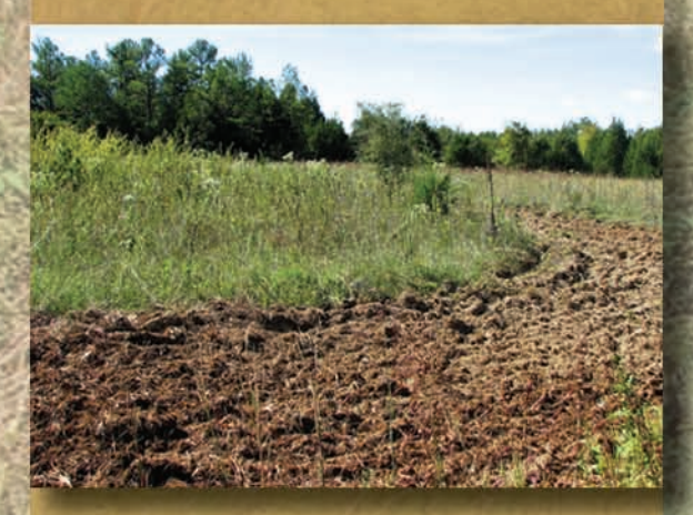
Figure 4. Native plum thickets provide valuable cover for small game and should be protected from burning. Disked fire brakes provide excellent brood-rearing habitat during the next growing season.