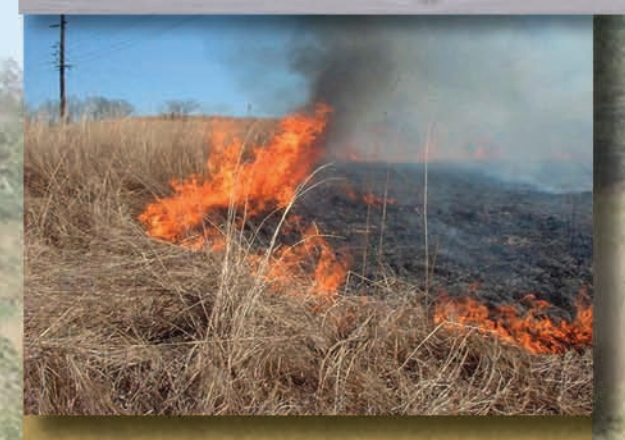
Figure 3. Dormant season prescribed burning helps rejuvenate old-fields and improves habitat for many species of wildlife.