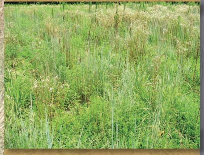
Figure 2. This field was successfully planted with 3.5 lbs/ac of NWSG and forbs. Low seeding rates help maintain adequate bare ground for bobwhite broods.