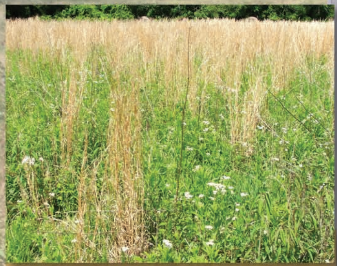
Figure 1. Tall fescue was removed from this field using 12 oz/ac of Plateau herbicide in November. Broomsedge and other desirable plants were released from the seedbank.